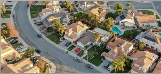
The American Dream