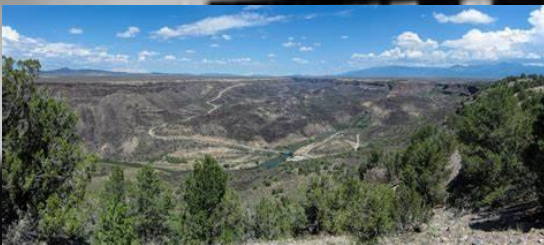
The Valley of Terror